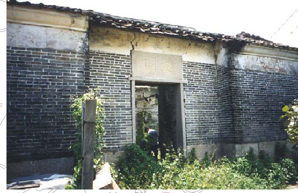
4 Man Ming Temple Grade II