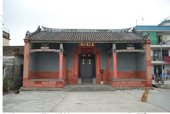
3 Hau Ku Shek Ancestral Hall Declared Monuments