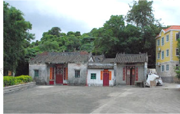
2 Hung Shing Temple & Pai Fung Temple Grade III