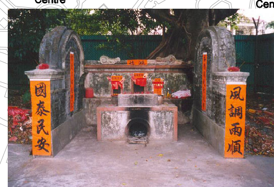
5 Earth God Shrine of Kam Tsin Tsuen Grade I