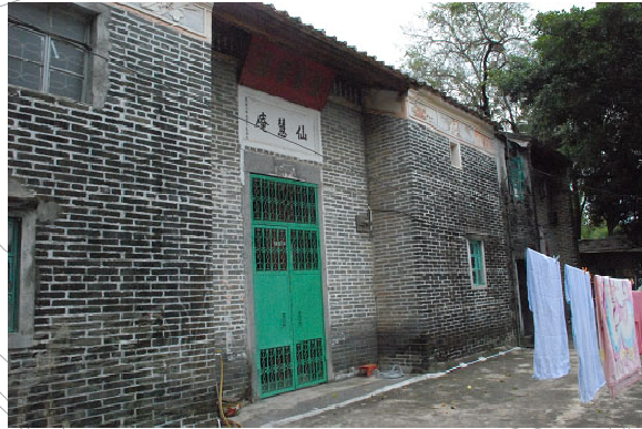
1 Sin Wai Nunnery Grade III