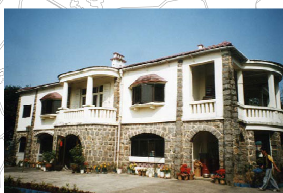
C Enchi Lodge