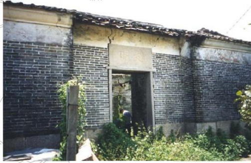
4 Man Ming Temple Grade II