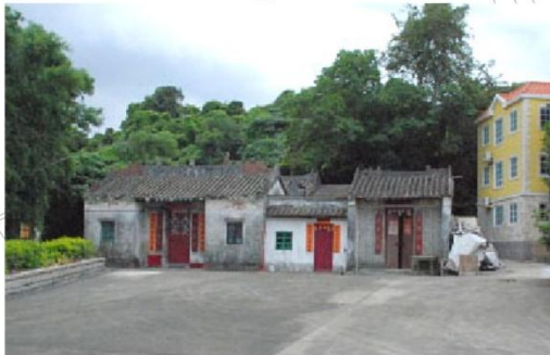
2 Hung Shing Temple & Pai Fung Temple Grade III