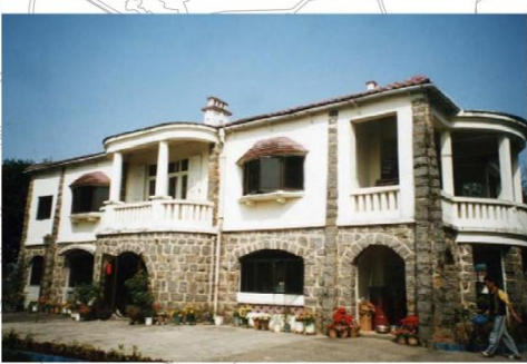
C Enchi Lodge