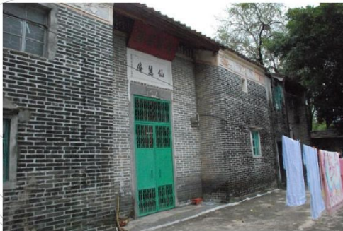
1 Sin Wai Nunnery Grade III