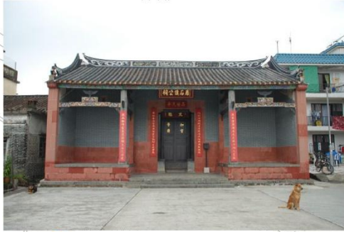
3 Hau Ku Shek Ancestral Hall Declared Monuments